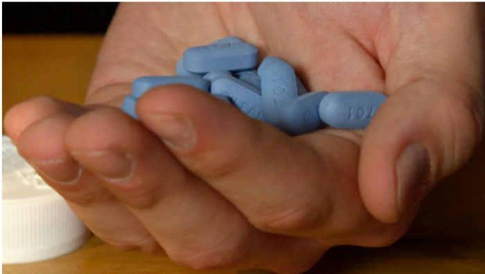
England has announced a clinical trial of the drug